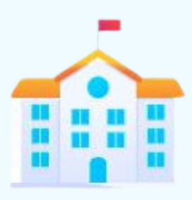
O2 Student residences